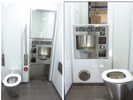
Inside a Danfo Modulet 120 DDA compliant

To mark the 75th anniversary of D-Day, Yarmouth Town Council is organising an afternoon tea party on June 6th at CHOYD for those of Yarmouth and Thorley who were around when it happened, - invitations will be going out soon. WW2 artefacts will be on display in the town and harbour, such as a motor torpedo boat, and celebrations and music continuing over the following weekend for all to enjoy.