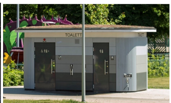
This is how The Common toilets could look with a Danfo Tetragon 110 unit

ytc1135@gmail.com www.yarmouthtowncouncil.co.uk 01983 527093/ 0771465433